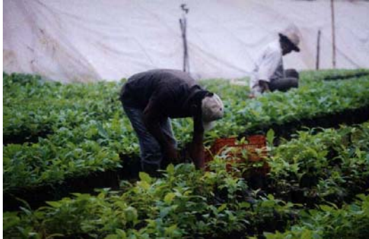
Care, knowledge and precision

Two of the most critical moments during a forestry project are the acquisition of land and Planting. Both activities must be done with care and knowledge, as they are the basis of future development. Soil properties, hydrology, quality of seedling genetics, handling of seedlings and nursery planning are just a few of the subjects that arise during these phases, in which DHForest is skilled.