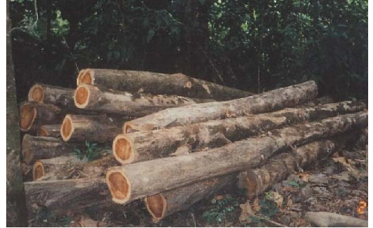
Marketing of plantation products

The marketing of your plantation products is one of the primary concerns of our clients. We maintain a broad web of connections that covers all phases off timber use, ranging anywhere between kilns, mills and export, which will positively influence the offset on the global market. If additional income is desired, our knowledge of carbon fixation, subsidies, unconventional non-forest products, etc. will broaden the possibilities.