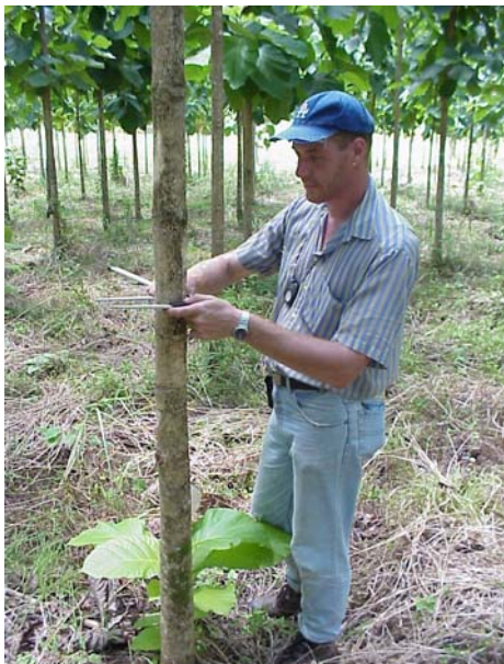
Growth monitoring is essential

Yearly measurements are the basis of all forestry activities within a plantation, such as, feasibility adjustments; yield prognosis, optimum thinning calculations, etc. Therefore, it is extremely important to maintain a high quality, statistically sound, survey network, another one of our specialties. Furthermore, the survey data will provide precise equations, used to determine the current value, growth and commercial volume of our client's assets.